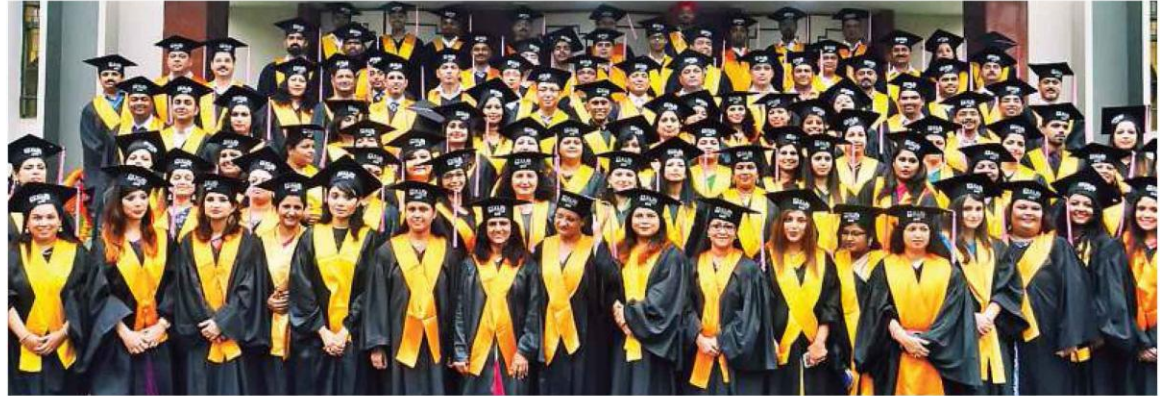
शनिवार को एक्सएलआरआई स्थित ऑडिटोरियम में दीक्षा समारोह में शामिल छात्र व छात्राएं। डिग्री लेने के बाद सभी ने एक-दूसरे को बधाई देकर फिर मिलने का वादा किया