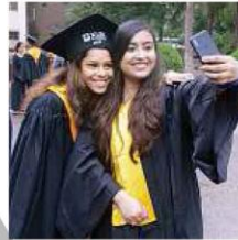
दीक्षा समारोह में खूब दिखा सेंटफी का क्रेज।