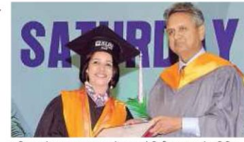
शनिवार को एक्सएलआरआई में छात्रा को डिग्री प्रदान करते अतिथि।