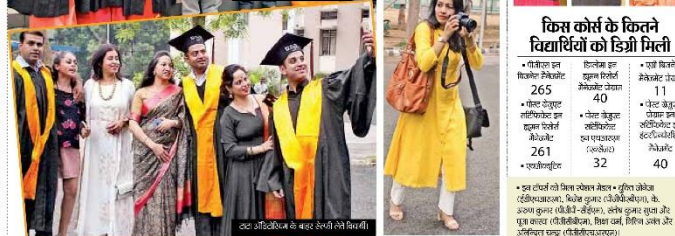
टाटा ऑडिटोरियम के बाहर डेल्फी लेते विद्यार्थी