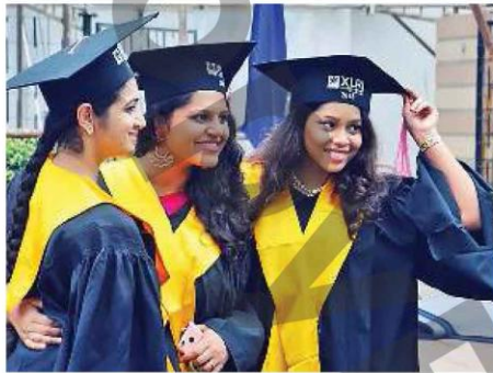
दोस्तों के साथ फोटो लेकर पलों को यादगार बनाती छात्रएं