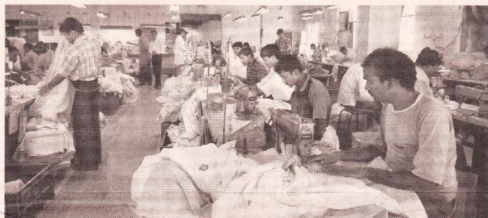
Workers in a textile factory. India has not ratified any of the three major conventions relating to occupational safety and health

The institutional framework governing industrial safety issues in India needs to be strengthened