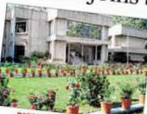
RARE HONOUR: XLRI in Jamshedpur