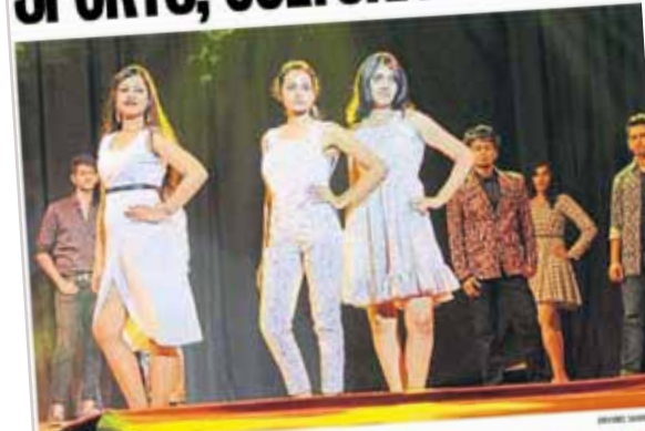
Participants at the fashion show.