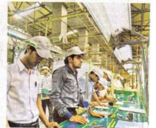
RESCUE ACT: The law applies to unorganised workers in factories, mines, plantations and construction.

Although there has been no official communication on the approval given by the Union Cabinet, top labour ministry officials said Labour Minister Bandaru Dattatreya moved the labour law amendments to the Lok Sabha Secretariat and it is expected to be introduced in the Lower House in the next few days.