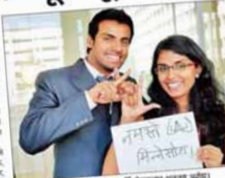
October 10, 2016, Naveen Jain and a woman holding a sign.

जमशेदपुर, 26 अगस्त : अमेरिका के बिजनेस स्कूलों ने नवंबर 2016 के 'न्यू फ्यूचर चैलेंज-2016' का कार्यक्रम जमशेदपुर में आयोजित किया। इस कार्यक्रम में 13 देशों के बिजनेस स्कूलों ने भाग लिया।