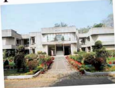
XLRI campus, Jamshedpur.

JAMSHEDPUR: XLRI - Xavier School of Management on Monday announced its new post graduate programme for certificate in Entrepreneurship Management for 2017-18 session. The last date for online registration for the course is June 23 next. The applicant to this programme has to be a graduate from a recognized university with an inclination for entrepreneurship. The course fees amounts to Rs 90,000 plus 15% Service tax, payable in two equal instalments + Rs 20,000 for books, etc and Rs 10,000 as Caution Money. The registration details are available at http://acad.xlri.ac.in/edc/ . The programme was launched in 2009 with ultimate objective is to create