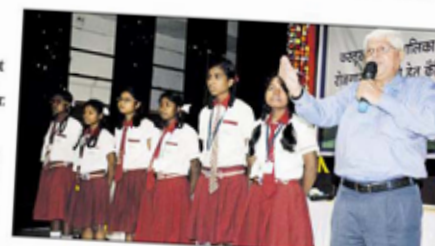
A career expert with alumni of Kasturba Gandhi Balika Vidyalyaya in Jamshedpur on Friday.