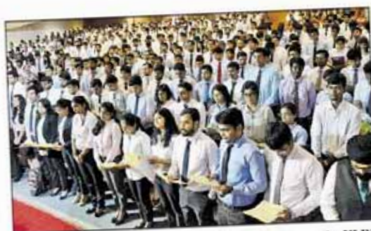
Freshers attend the inaugural academic session on the XLRI campus in Jamshedpur on Monday.

A total of 537 students have enrolled for the three flagship programmes — business management, human resource management and general management — this year. While the business and human resource management courses have 181 students each, the general management programme will accommodate 109. Apart from this, 51 students have enrolled in the three-year PG diploma in management (part time), nine