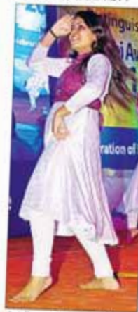
होमकमिंग समारोह में रंगारंग कार्यक्रम प्रस्तुत करती संस्थान की छात्रा।