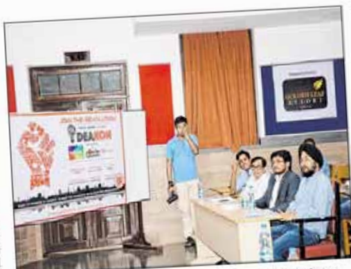
Students and guests at IdeaKon at XLRI, Jamshedpur, on Sunday.