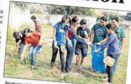
Students pick up litter from the grounds of Khalsa Middle and High School in Golmuri on Saturday.