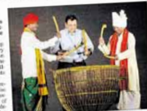
Cyrus P. Mistry plays the mridanga at tribal residence Samruddh at Gopal Nandan in Bhopal on Tuesday.

Here it's a global campus of business education, not a global corporate one to launch it. Jamshedpur, Nov. 16: Group chairman Cyrus P. Mistry was in town Monday on Sunday to inaugurate the new global campus of XLRI. The 100-acre campus, set up near the Tata Steel township, is a landmark project for the group. Mistry, who is also chairman of Tata Steel, inaugurated the new campus, which is a landmark project for the group. The campus is a landmark project for the group. The campus is a landmark project for the group.