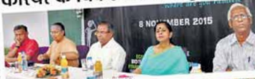
जेवियर लेबर रिलेशन्स इंस्टीट्यूट में आयोजित कार्यक्रम का समापन। छात्रों ने फन, गेम्स और मस्ती संग पुरानी यादों को किया ताजा।

जमशेदपुर, 8 नवंबर (एनआईएन) - जमशेदपुर के पूर्ववर्ती विद्यार्थियों ने जेवियर लेबर रिलेशन्स इंस्टीट्यूट में आयोजित कार्यक्रम का समापन किया। कार्यक्रम में छात्रों ने फन, गेम्स और मस्ती संग पुरानी यादों को किया ताजा। कार्यक्रम में छात्रों ने कॅरियर के विकल्प से छात्र हुए अवगत।