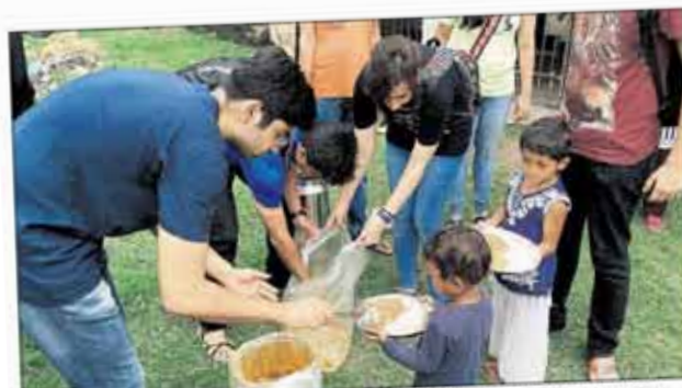
XLRI students feed hungry children in Jamshedpur as a part of their project with Helping Hearts Foundation.

If you are a do-gooder with a bunch of feasible ideas, but lack the business acumen to promote and sustain them, XLRI will be happy to help.