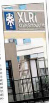
XLRI in Jamshedpur