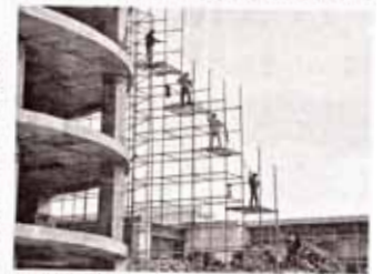
NOT INCLUSIVE: About 75% of India's 474 million workers are not covered by written legal contracts.

Wage payment in cash meant employers and workers did not have to lose sleep over such concerns before the demonetisation exercise. These apprehensions were voiced by representatives from various export segments, including from labour-intensive sectors such as agriculture, leather, textiles, carpets, handicrafts and engineering, during a meeting with the commerce ministry officials on Tuesday.