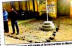
Black money is being dumped in Jan Dhan accounts in Ghatshila.

Small businessmen are playing the trick to convert their black money. The only way to stop this practice is by roping in the income tax department to monitor the deposits in banks. Small businessmen are playing the trick to convert their black money. The only way to stop this practice is by roping in the income tax department to monitor the deposits in banks.