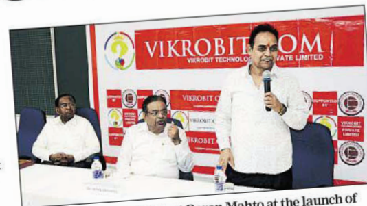
Jamshedpur MP Bidyut Baran Mahto at the launch of Vikrobit.com at XLRI on Sunday.