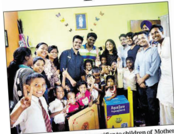
XLRI students donate a water purifier to children of Mother Teresa Welfare Trust in Jamshedpur.